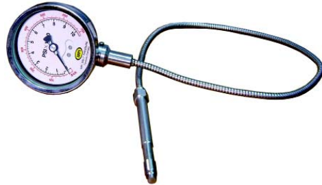
MPG200 - Rigid Stem + Flex

MPG2 X X P XX X X X 0 - 6" Stem 0 - 30" Flex 5 M - Psi x 1000 DIAPHRAGM STEM EXIT 1 - 12" Stem 1 - 60" Flex 10 B - BAR x 100 S - STANDARD INCONEL - - STANDARD BOTTOM 20 H - HASTELLOY T - TOP EXIT 3 - TRIPLE WEAR TIP