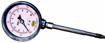
MPG100 - Rigid Stem

MPG1 X P XX X X X 00 - 6" Stem 5 M - Psi x 1000 DIAPHRAGM STEM EXIT 10 - 12" Stem 10 B - BAR x 100 S - STANDARD INCONEL - - STANDARD BOTTOM 20 H - HASTELLOY T - TOP EXIT 3 - TRIPLE WEAR TIP